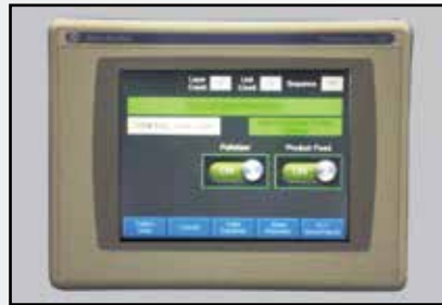
User-Friendly Operator Controls