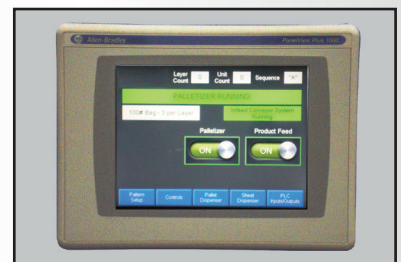
User-Friendly Operator Controls