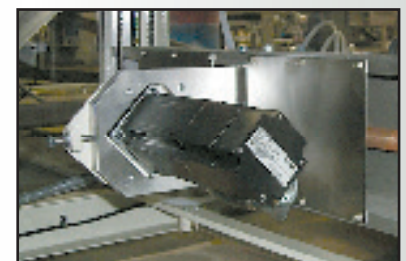
Servo-Driven Sealing System for Lower Operating Costs and Better Efficiency