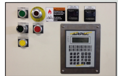
User-Friendly Operator Controls