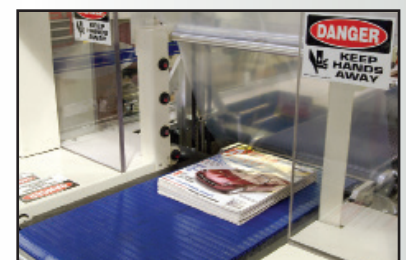
Automatic Product Height Detection for Random Sizes