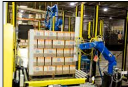
Wrapping Station with Optional Corner Board Robot