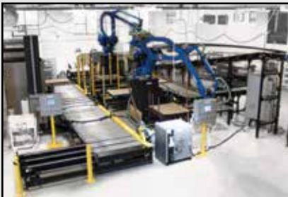
Various Conveyor Configurations