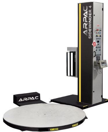
SIDEWINDER 4 LP WNW