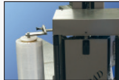
"Swift Change" Film Mandrel