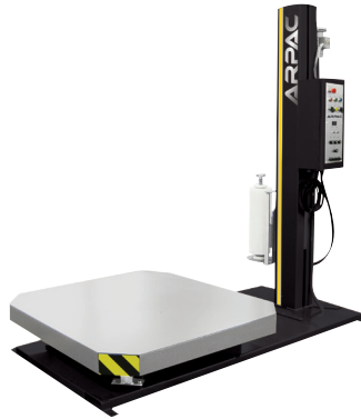
PATRIOT HP WNW