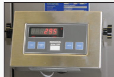
WRAP-N-WEIGH® Operator Controls