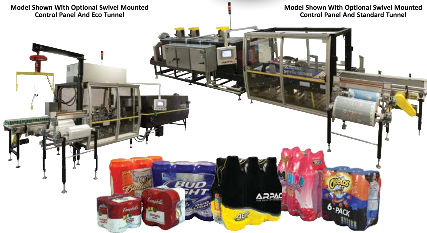
Model Shown With Optional Swivel Mounted Control Panel And Standard Tunnel

The BRANDPAC™ BPMP-5000 SERIES is the champion in multipacking equipment for medium to high volume food and beverage industries. This versatile continuous motion bottom overlap shrink wrapping system operates on demand, without a seal bar to shrink wrap up to 75 unsupported multipacks or trays per minute, depending on the height and weight of the product.