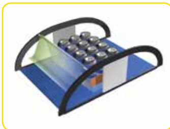
Film Cut from the Supply Roll