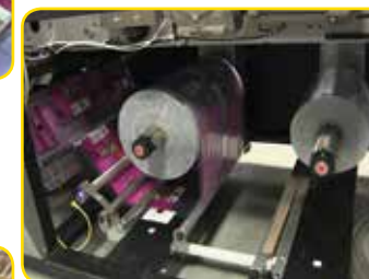
Inline Film Rack and Film Splicing Bar for Quick and Easy Film Changeover