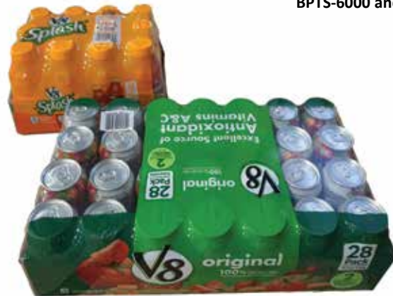
Tray Supported Product Shown