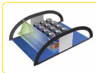
Film Cut from the Supply Roll