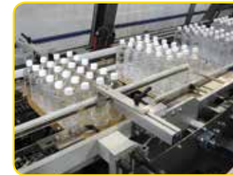
Tray Forming and Loading Section