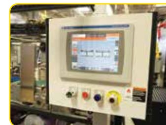
User-Friendly Operator Controls