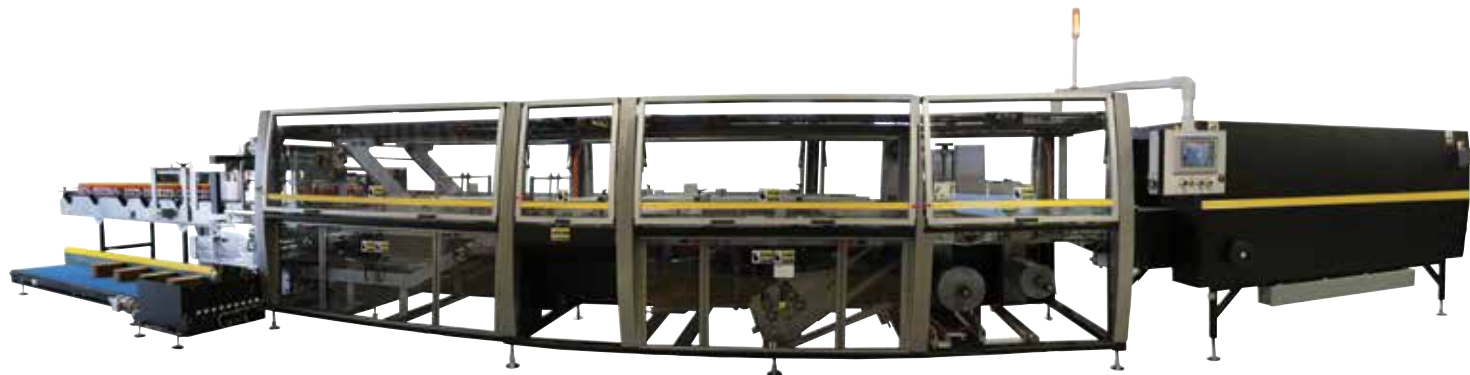
BPTS-6000 and ECO-Tunnel Shown

ARPAC's BRANDPAC® BPTS-5000 is easily integrated into new and existing production lines with other ARPAC packaging equipment.