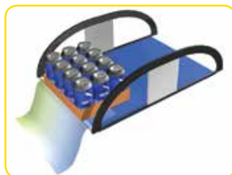
Servo Controlled Film Feed for Exact Print Registration