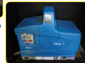
Standard Nordson ProBlue® Glue Unit