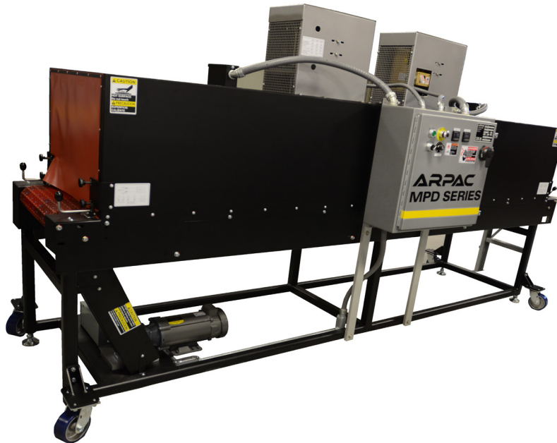
MPD163090 model shown