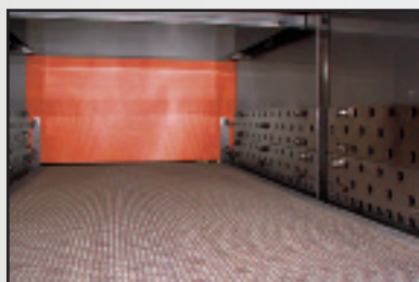
Mesh Belt Conveyor