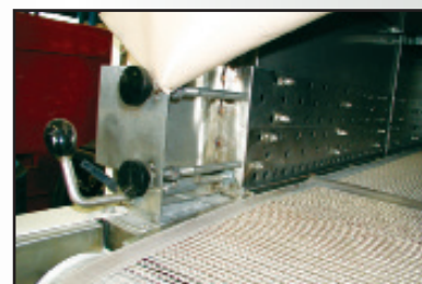
Air Flow Adjustment Louvers to Control Velocity and Direction of the Air Flow