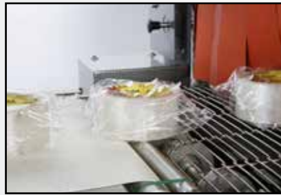
Chain Mesh Belt