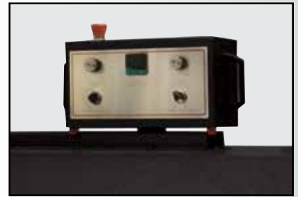
Easy To Use Swivel Control Panel

Complete Aftermarket Service & Support for Your Packaging Equipment