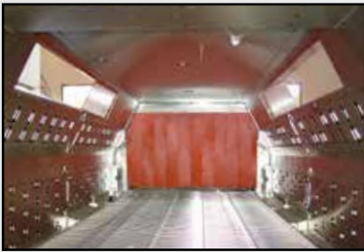
Viewing Windows on Both Sides of the Tunnel